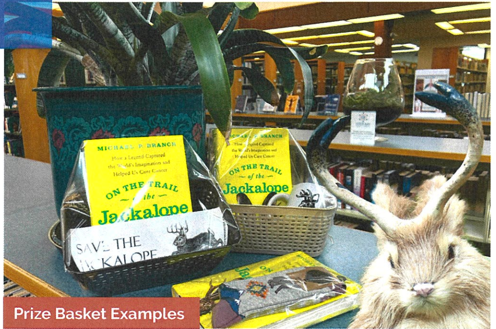
Prize Basket Examples